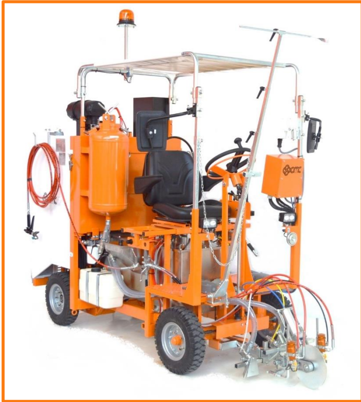
Photo doesn't show standard machine.

Dimensions 220x90x h without sunshade roof 185 cm; Weight: 825 Kg