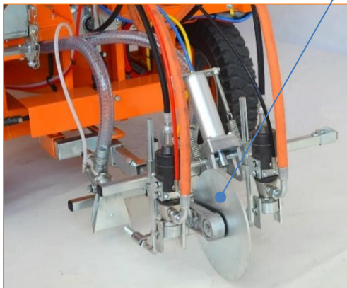
Automatic glass bead gun