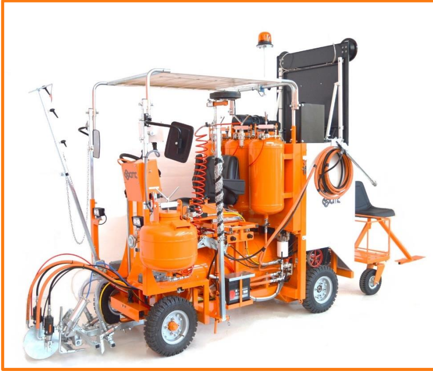
Photo doesn't show standard machine.

Dimensions: 220x90x h without sunshade roof 185 cm; Weight: 825 Kg